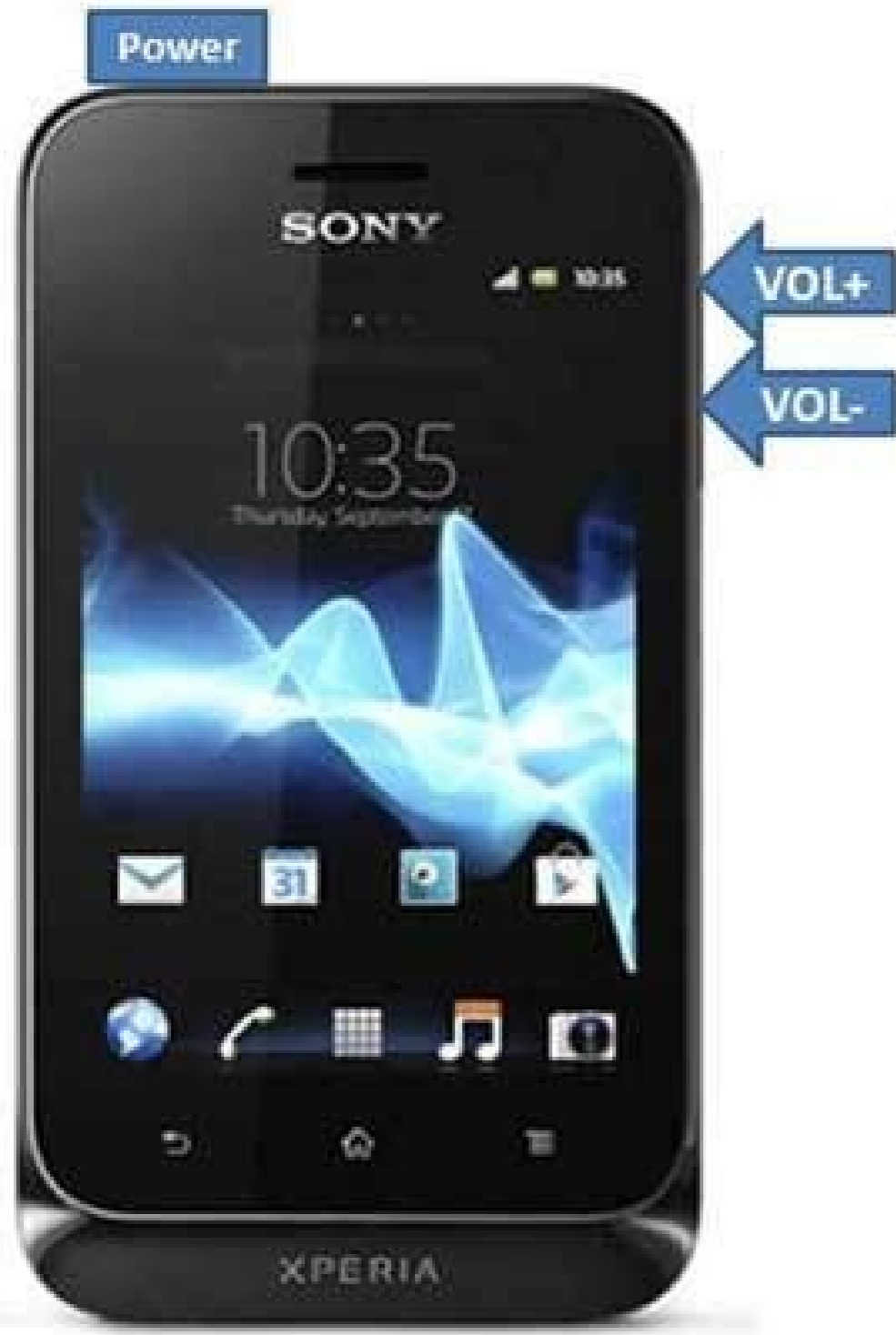
How to remove screen lock password on sony xperia. Sony mobile pattern lock reset. Reset locked sony xperia. How do i unlock my sony xperia if i forgot the pattern.